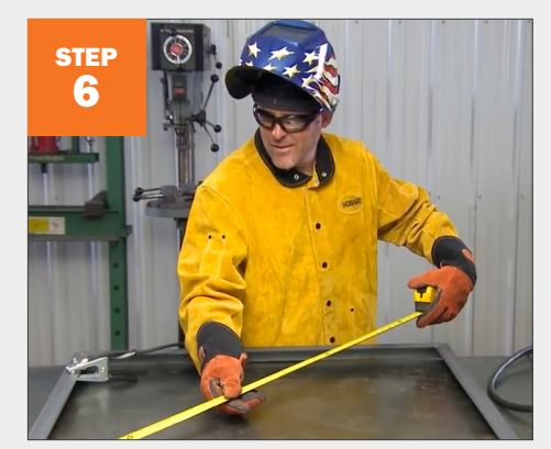
When all four corners are tack welded, flip over and make sure you are squared.