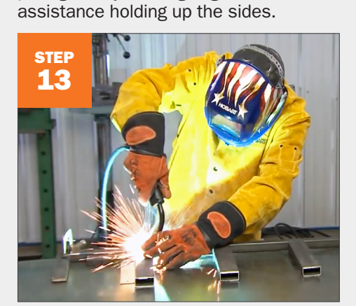
Weld the decorative side pieces. In video: Place 1" \times 1" \times .065" tubing horizontal on table with three pieces of 1" \times 2" \times .065" tubing standing on top. Weld together.