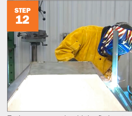
Tack, square, and weld the firebox to the frame.