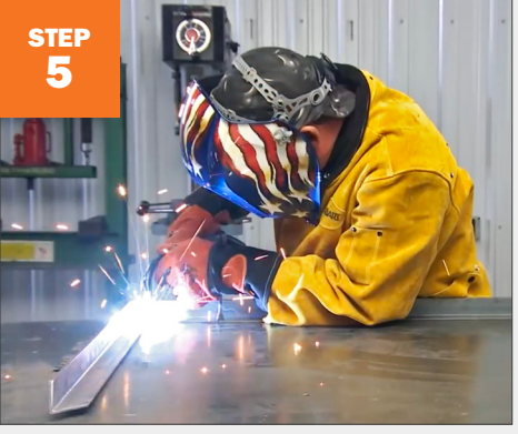
Tack weld corners into place.