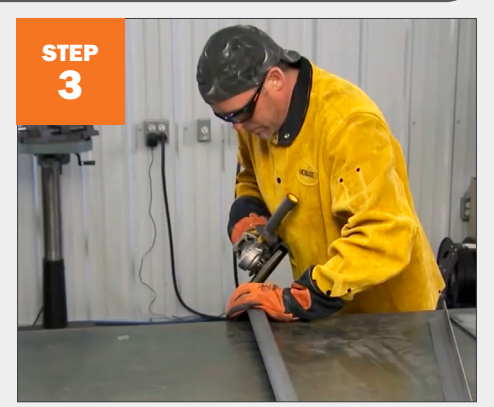
Use a grinder to bevel edges