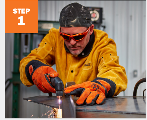
Cut 3/16" plate pieces.

Tip: Use a straight scrap piece of metal to help create straight line.