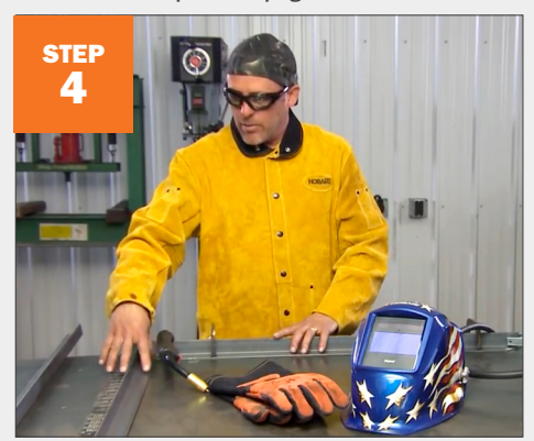
Clamp two corners down to table and make sure it is square.