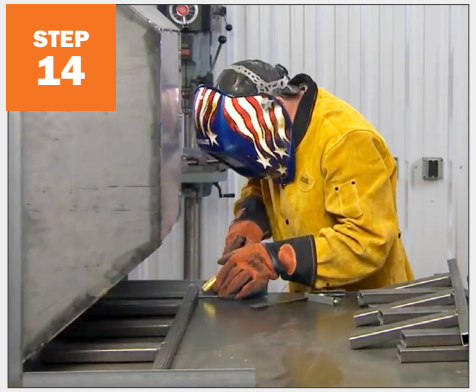
Turn fire pit on its side so it is easier to weld decorative sides in.