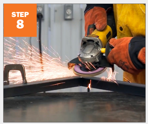
Grind to make smooth.