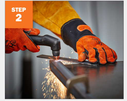
Cut tubing and angle iron to length. Then cut a 45-degree angle in top four edges of angle iron.

Tip: Use a straight scrap piece of metal to help create straight line.