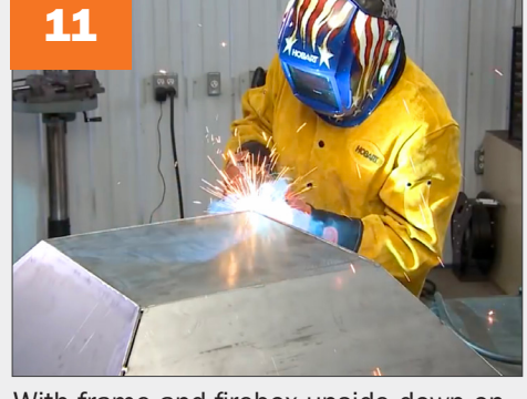
With frame and firebox upside-down on the table, place the firebox inside the frame.