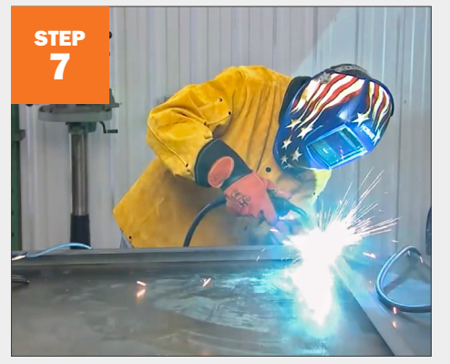
Weld the top of each corner.