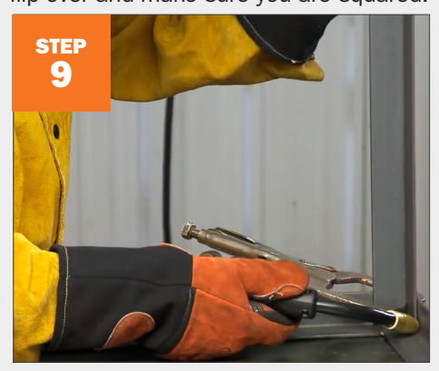
Tack legs into corner on the inside of the frame to hide corner welds.