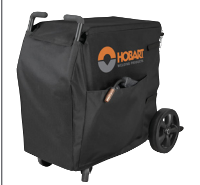
Protective Cover 770973 Form-fitted, vinyl-laminated, polyester fabric resists stains and mildew and protects the finish of your welder.