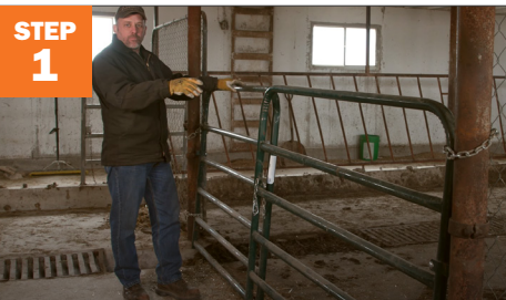
STEP 1 Take measurements for the gate.