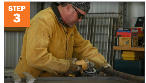
STEP 3 Angle grind tube ends to clean.