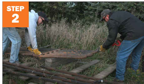
STEP 2 Gather materials.