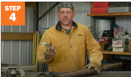
STEP 4 Lay out the materials, use spacers to keep materials even.