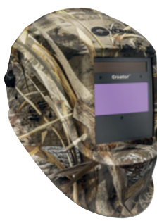
Realtree® Camo #770869