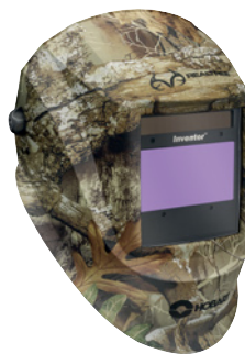
Realtree® Camo #770875