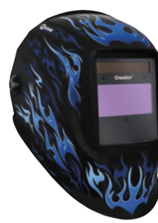
Fire and Ice™ #771016